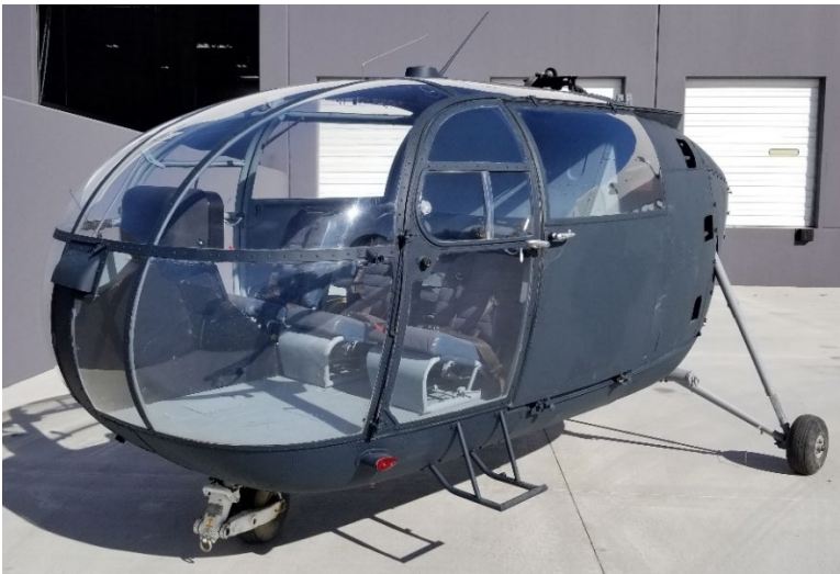
Pictured without tail boom removed.

Note: Main and tail rotor assemblies are not available.