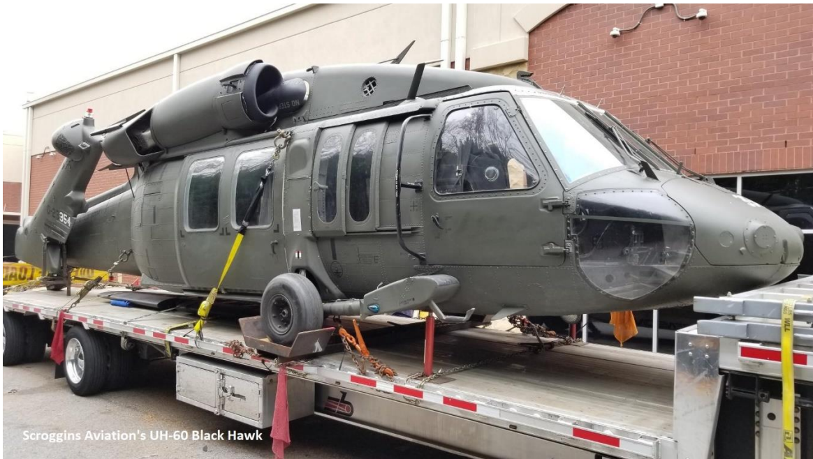
Shipping the UH60 via a step-deck trailer using a main landing gear cradle.