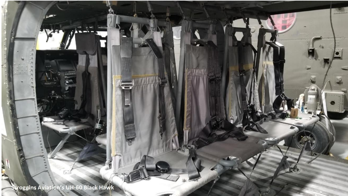
The cabin is equipped with UH60 troop seating and gunner seats left and right.