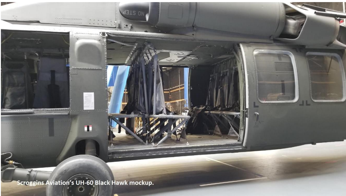
Scroggins Aviation's UH-60 Black Hawk mockup.

Rear crew cabin with working sliding doors on the left and right side of the UH60.