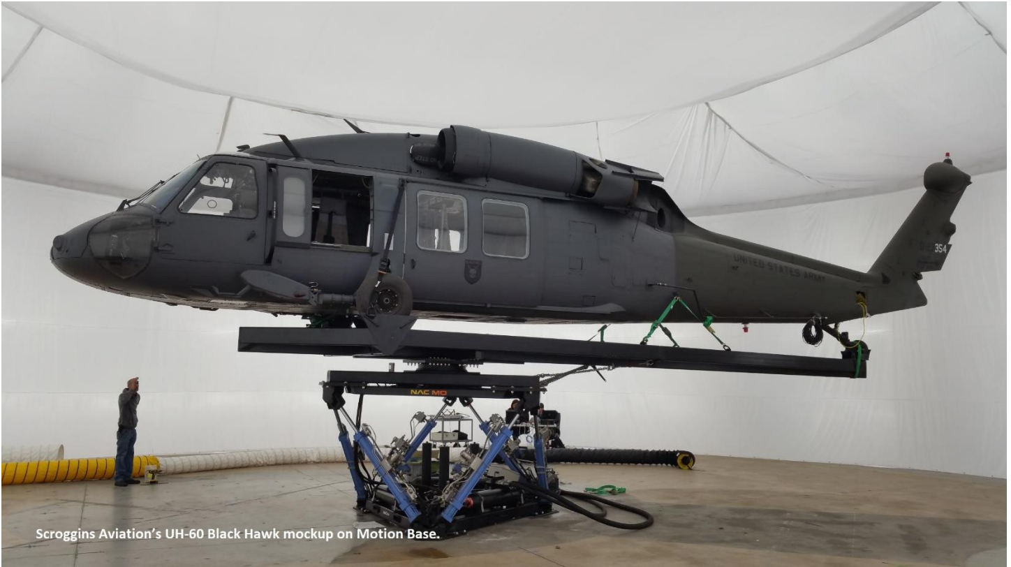
Scroggins Aviation's UH-60 Black Hawk mockup on Motion Base.