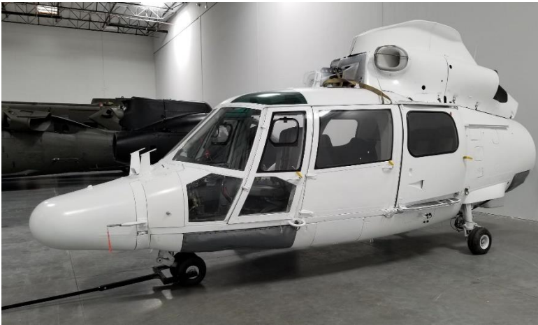
Mockup shown on gear with tail boom removed (Rotor blades not included)

Instrument Panel: There are 4 video display screens (color) with DVI/HDMI inputs, video playback required.