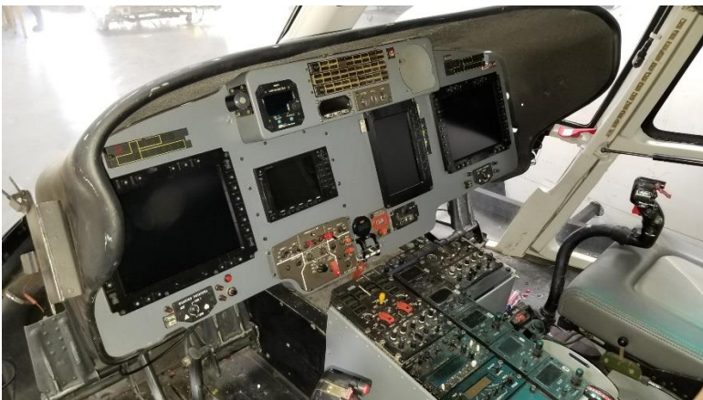
Forward cabin with gray interior