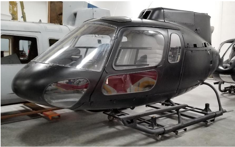
Pictured with Tail boom and rotor/blades removed

Note: Main and tail rotor assemblies are available.