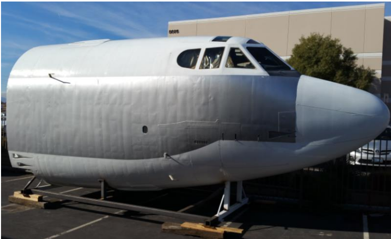
Mockup shown on base and has casters.

Instrument Panel: There are 2 video display screens (green), video playback required. The other gauges are analog.