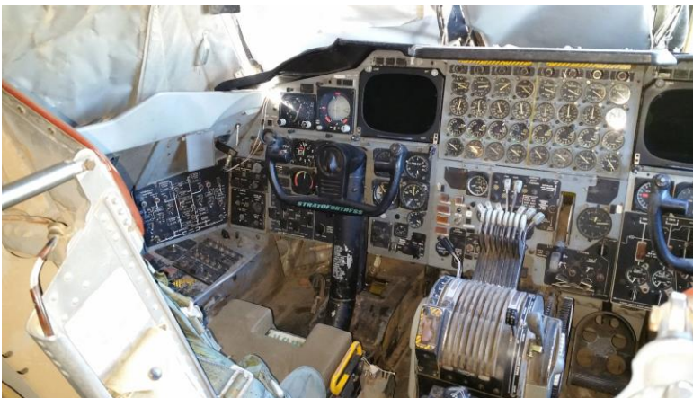
Cockpit compartment shown (Pilot side).