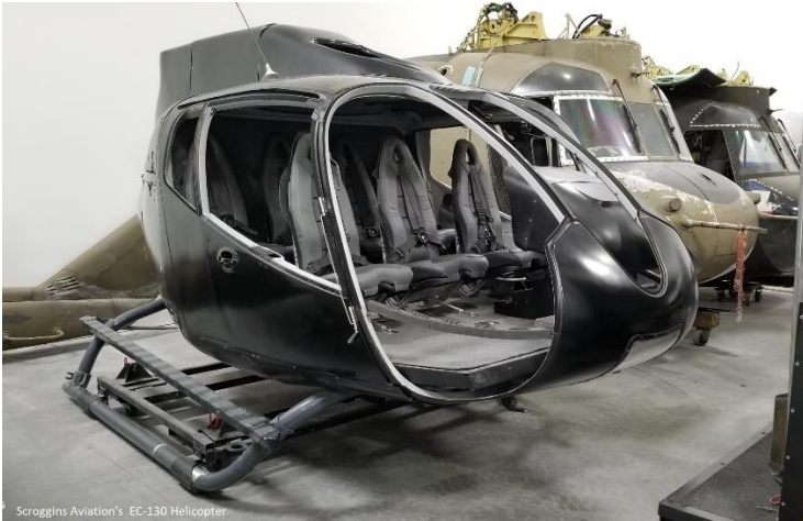
Scroggins Aviation's EC-130 Helicopter

Note: Skids on transport base and can be mounted on a gimbal.