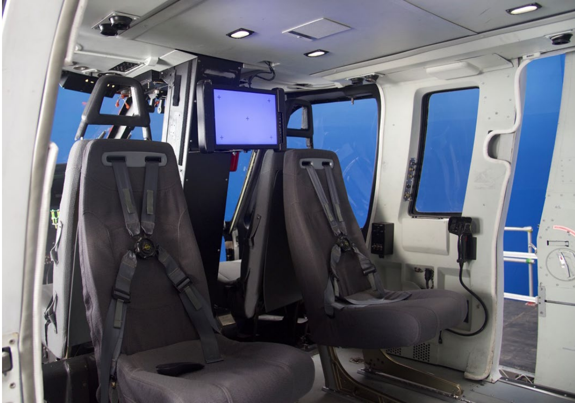
Hoist control wall panel