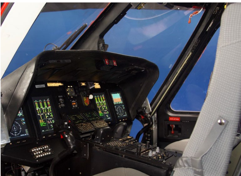
Cockpit compartment with a newer S-76 D model panel. A total of 7 color playback screens.