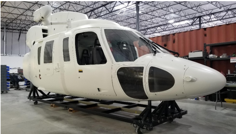
S76 shown with hoist above the slider doors and mounted to a base with casters.

Instrument Panel: The panel is built with seven (7) flat digital screens for playback.