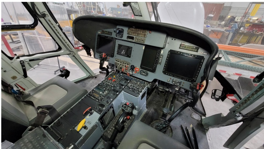
Cockpit complete with full color screen displays (playback required). Cockpit windows are wild.