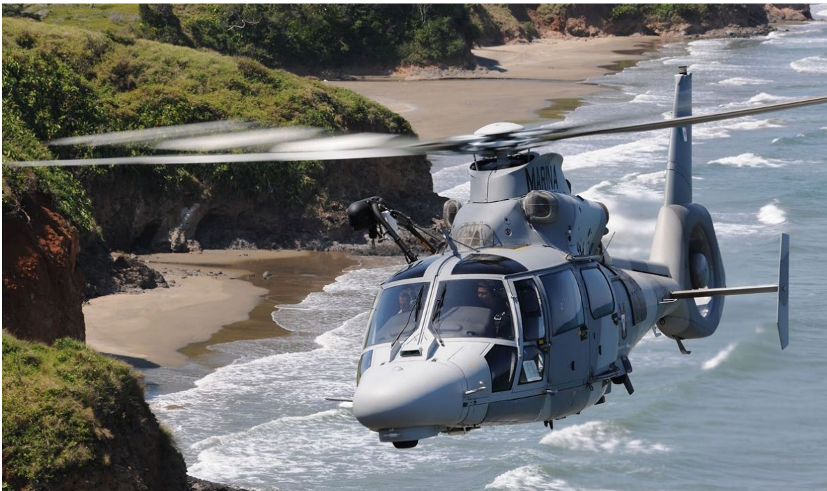
File photo of the As565 (As365) in flight.

As365 shown loaded onto a step-deck trailer.