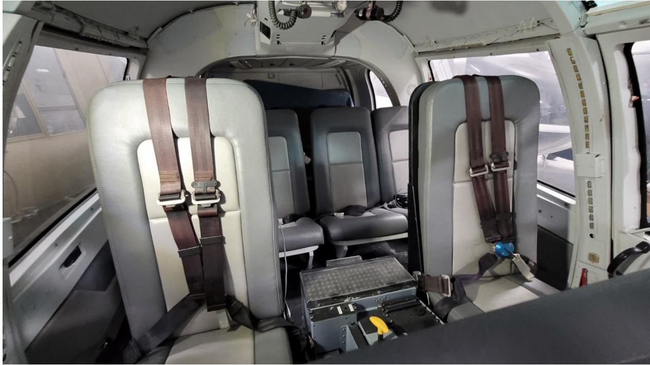
View looking at the pilots. Cockpit windows are wild.