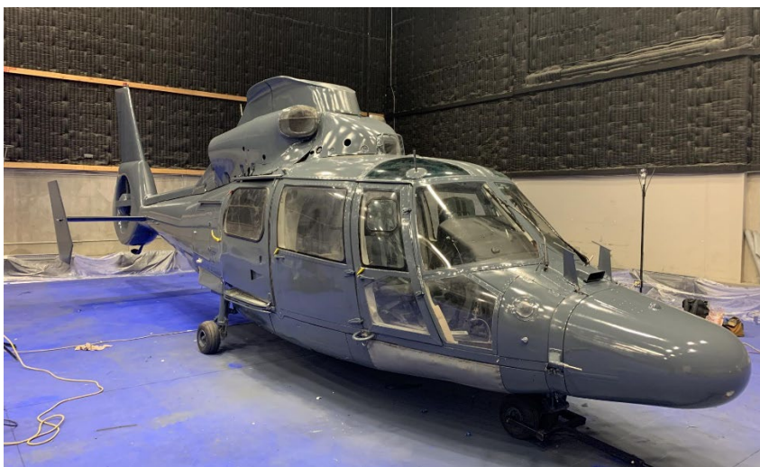
As365 (As565) shown with a gray (wax) paint.

Instrument Panel: There are 4 video display screens (color) with DVI/HDMI inputs, video playback required.