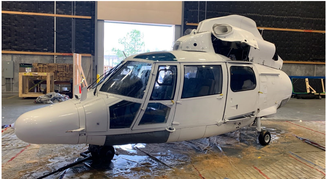
As365 shown on stage with the tail boom removed. It also have a total of 6 doors, two are sliding doors.