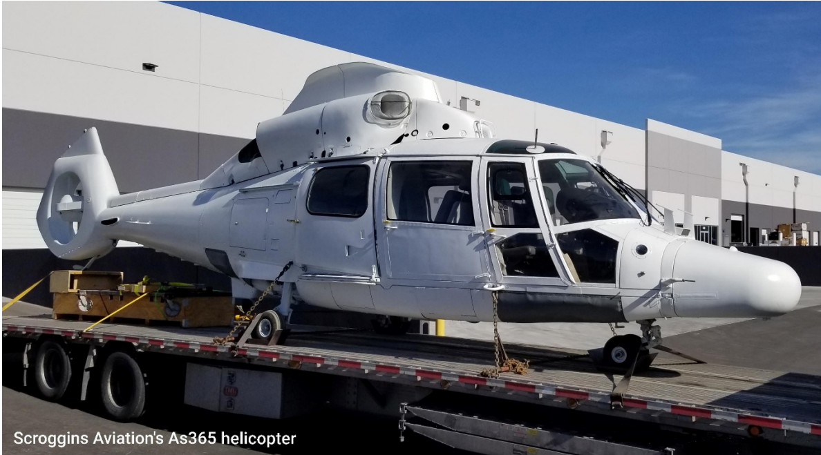
Scroggins Aviation's As365 helicopter

As365 shown loaded onto a step-deck trailer.