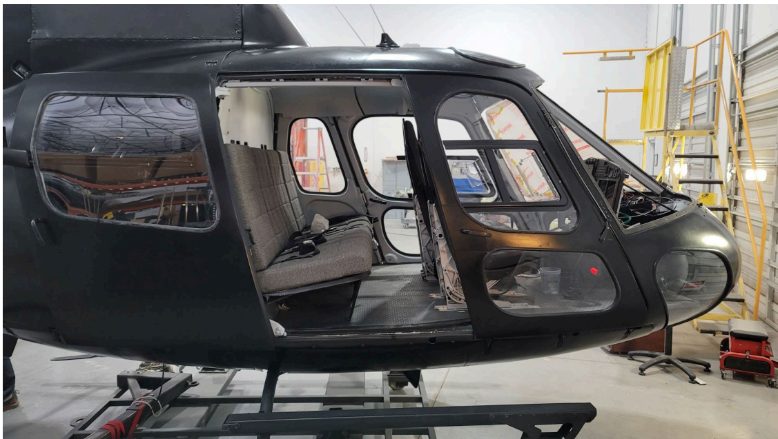
Shown with main front windows removed and right-side sliding door open.