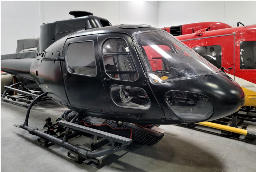
Pictured with rotor/blades removed

Note: Main and tail rotor assemblies are available.