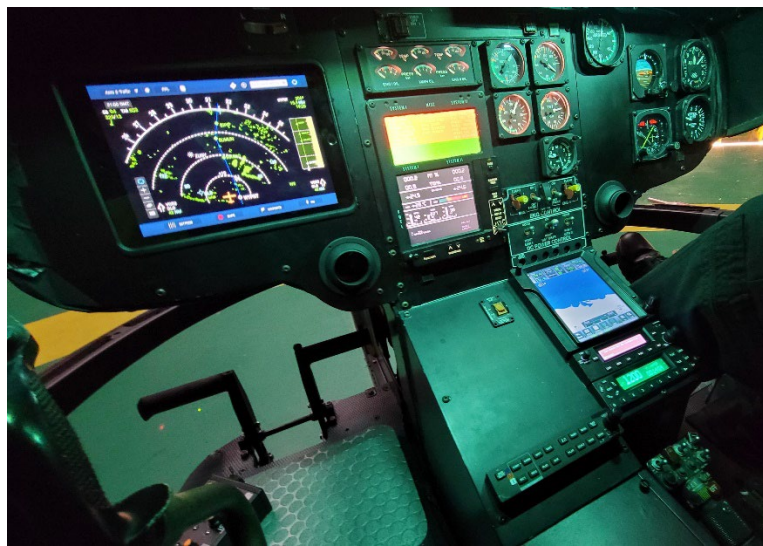
Cockpit panel (playback on screens not included)