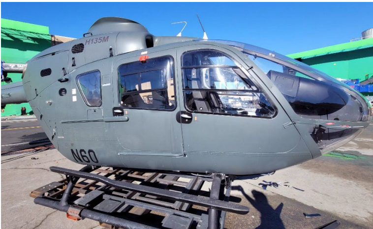
Shown with a removable military green (wax) paint.

Note: Transport base for skids can be mounted on a gimbal.