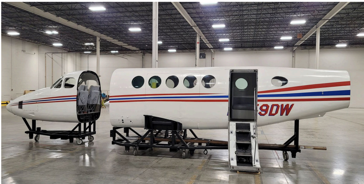
Shown with cockpit detached (wild) and cabin door dropped down.