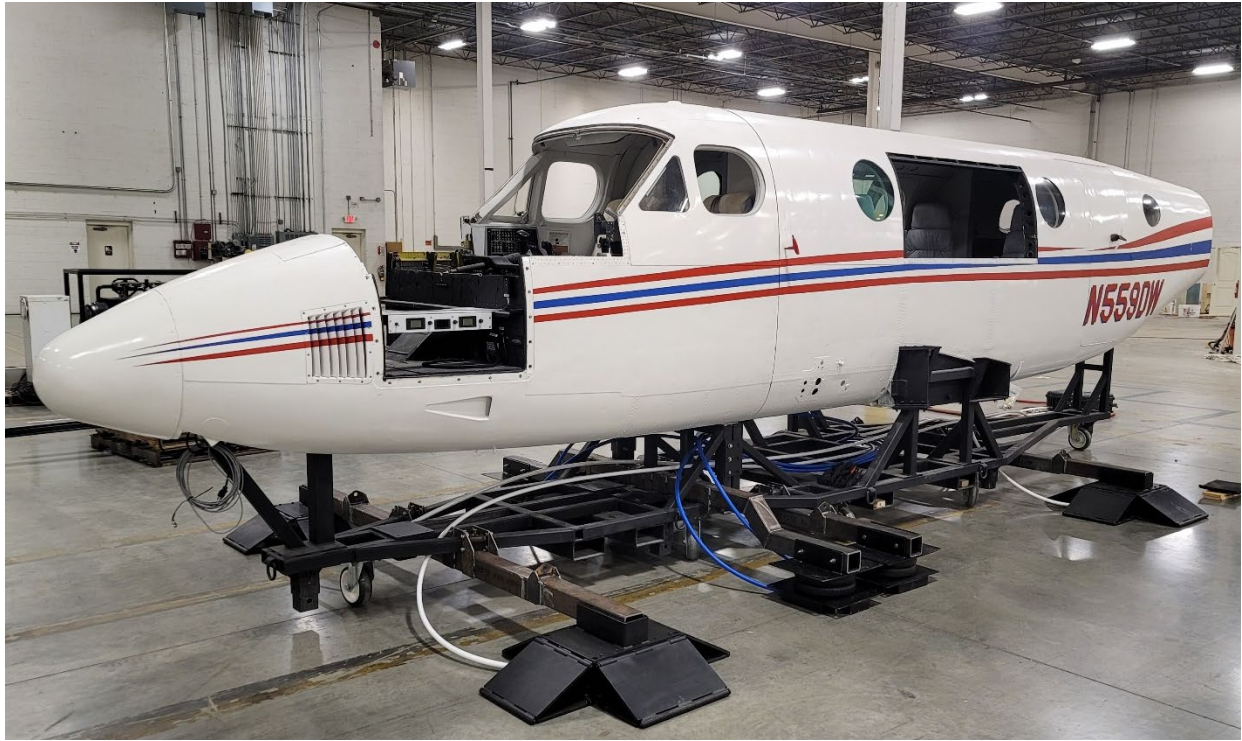
Shown placed on airbags to simulate flight / turbulence inflight. (Airbags not included)