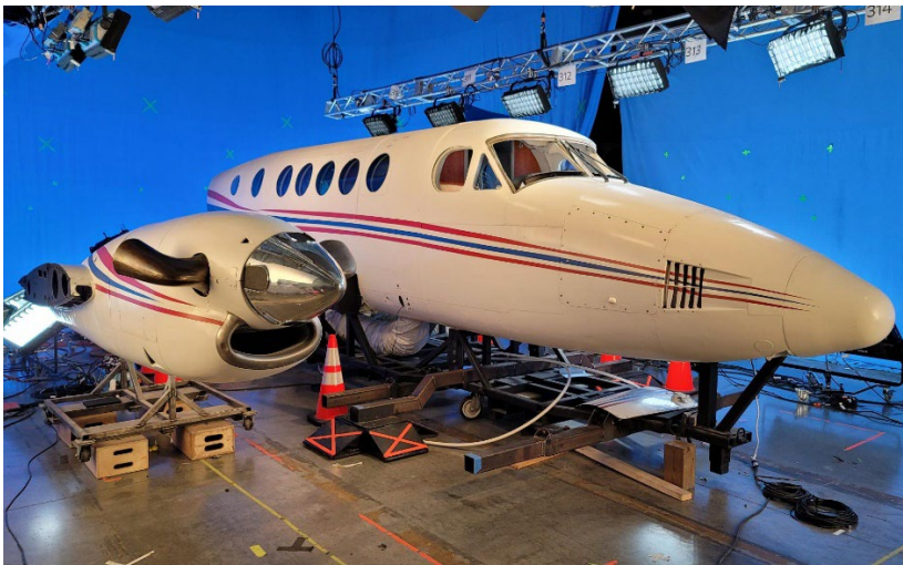
King Air 200 (B200) fuselage shown with engine nacelle.

Note: Fuselage is mounted to a steel base, the cockpit and forward panel is wild. The cabin has two wild panels