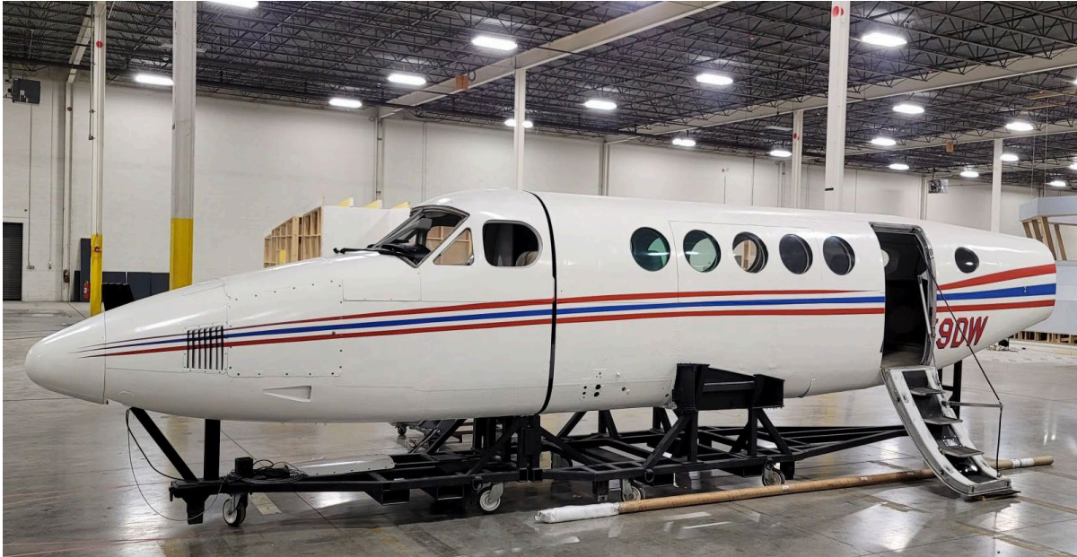
Shown on a steel frame for moving on stage and on motion platform.