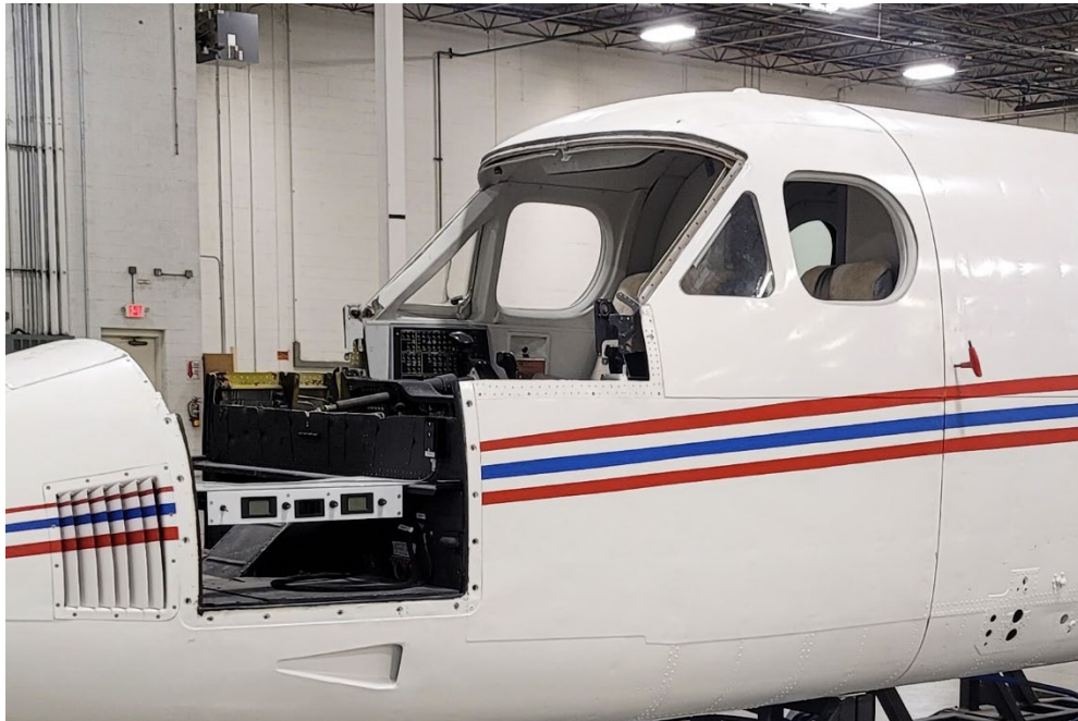
Shown with front wind-screen structure and panel removed (wild) for up-close angles.