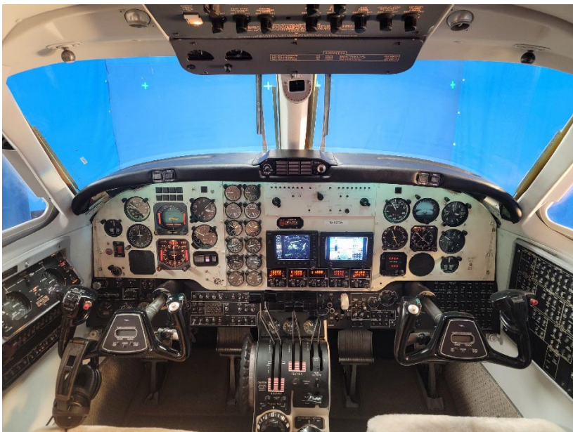
B200 with classic (analog) panel (optional glass cockpit is available)

Weight: 6,500lbs w/ base (all is approx)