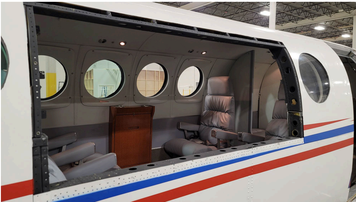
Shown with wild wall panel removed. Both left and right are wild.