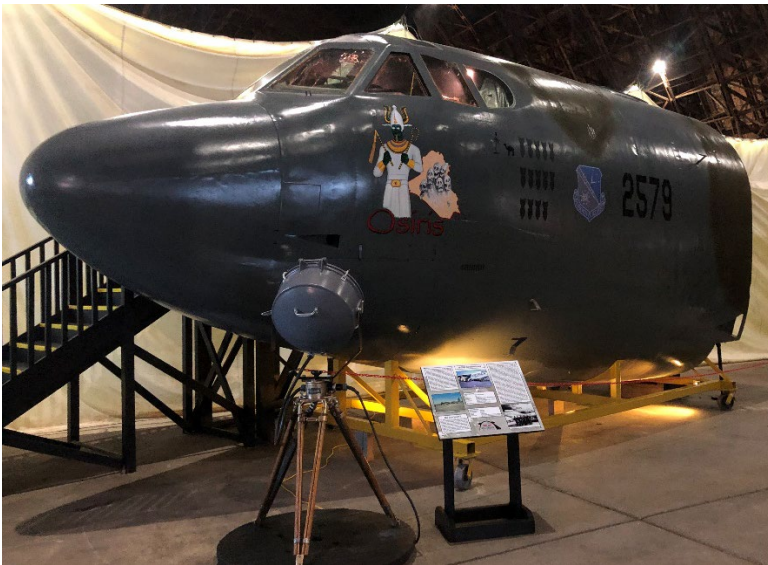
Mockup shown on base and has casters, (Shown on display).

Instrument Panel: There are 2 video display screens (green), video playback required. The other gauges are analog.