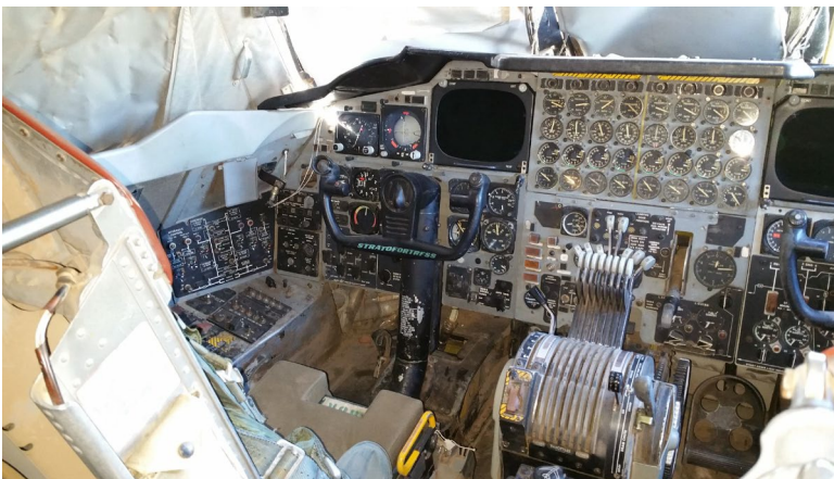
Cockpit compartment shown (Pilot side).