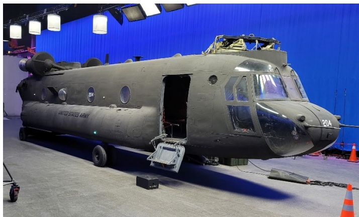
Chinook shown without the upper rotor pylons (towers) installed

Note: The rear cargo ramp lowers electrically. CH-47 can fit up to one H1 Hummer (with gear) or two Jeeps.