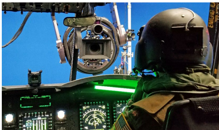
Shown with wild cockpit windows removed.