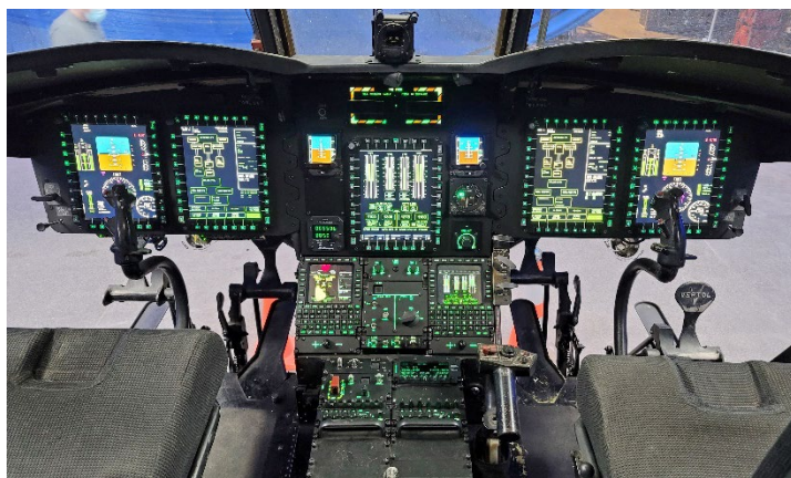
Modern cockpit panel set up for playback.

Upper Pylons (towers) are optional (rotor blades not included)