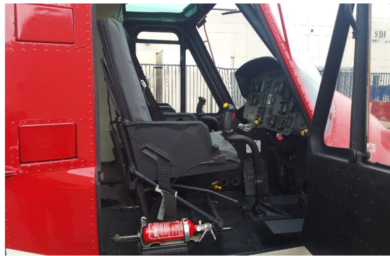
Mockup shown on base and has casters.