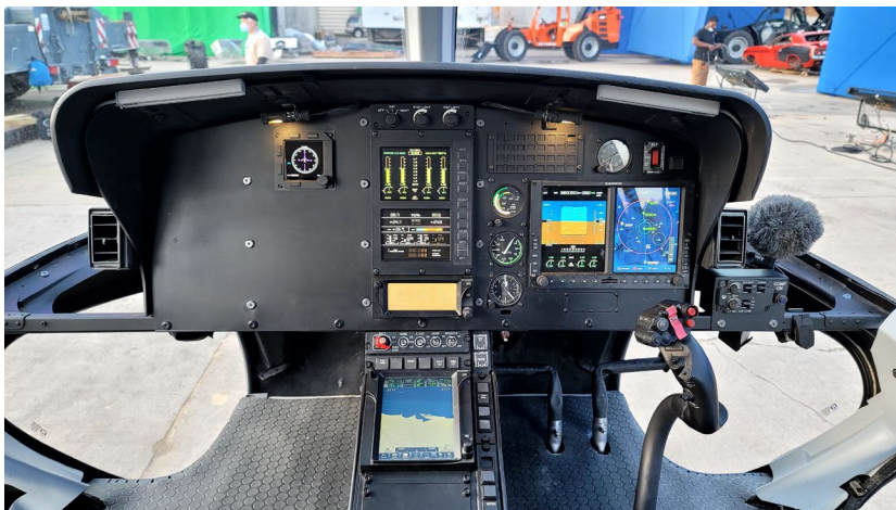
As350 (H-125 modern panel) with HDMI monitors for playback