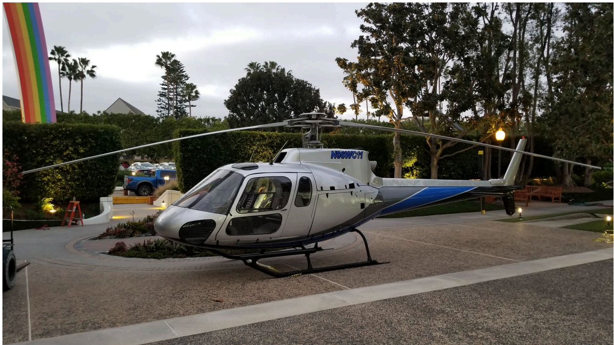
Shown with rotor blades installed.