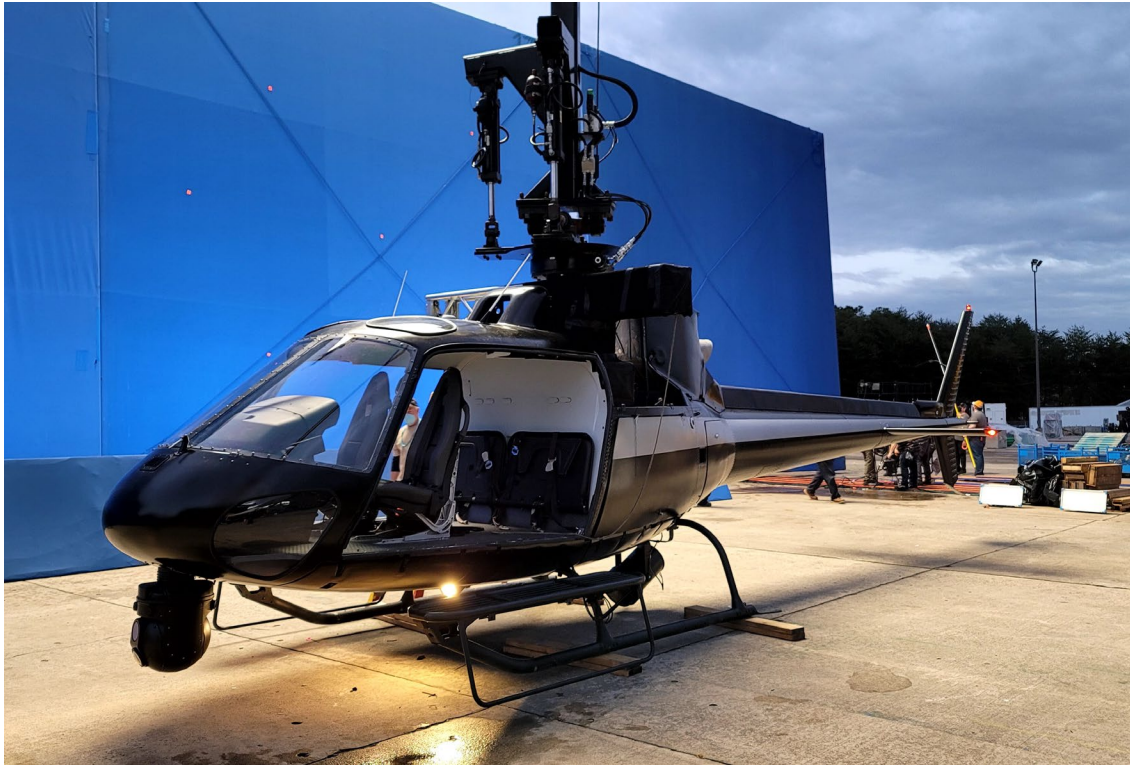
Shown with all doors removed