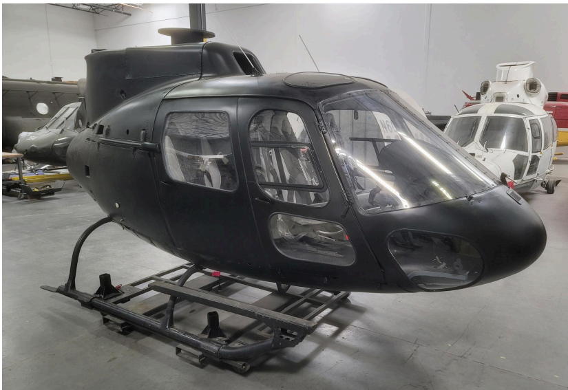
Pictured with rotor/blades & tailboom removed

Note: Main and tail rotor assemblies are available.