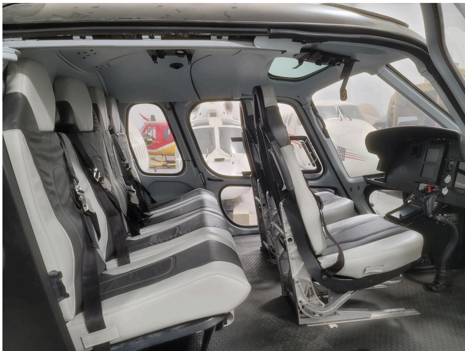
Shown with modern seating (4 in the rear and two in front) also featured with a right-side sliding door.