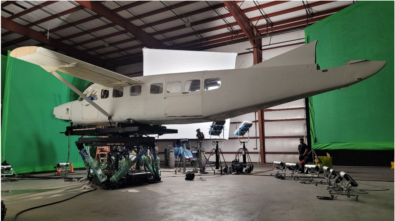
C-208B shown with its shorter wing mod for sound stage space and main landing gear removed.