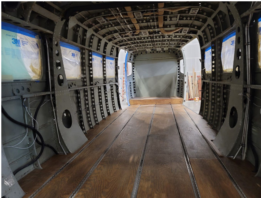
Rear cargo compartment (passenger cabin option removed).