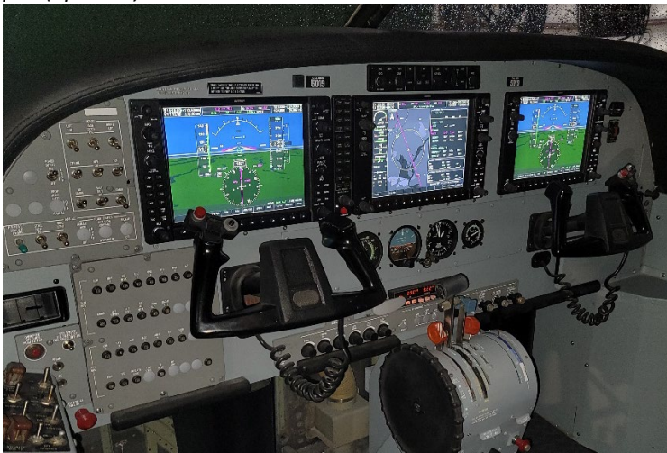
C-208B EX with G1000 cockpit set up with HDMI playback.