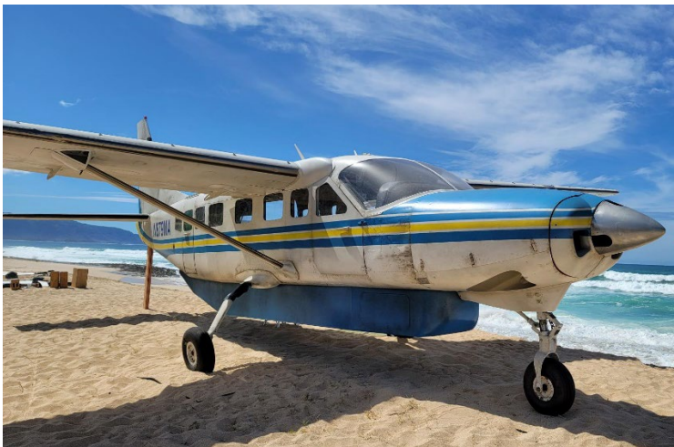
C-208B should with wax painted exterior, wing extensions and belly pod (optional)

Note: Fuselage ships with its main landing gear removed, but its original landing gear is available. The main wings are shorter (cutdown) for stage space and gimble work. The forward cockpit windows and complete instrument panel are wild. The pilot and passenger seats can be removed.