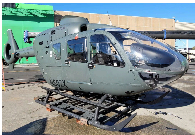
Shown with a removable military green (wax) paint.

Note: Transport base for skids can be mounted on a gimbal.