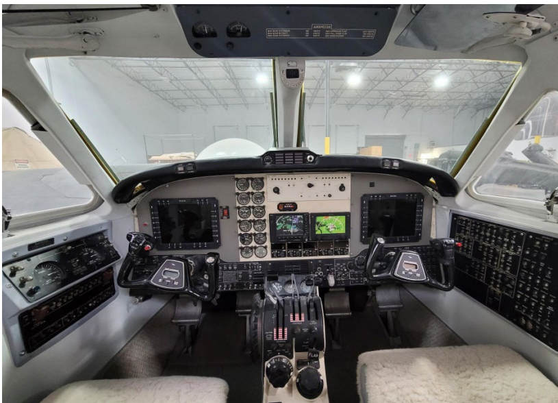
B200 with two digital displays (Apple iPads) and analog gauges plus two static displays (backlit)

Weight: 6,500lbs w/ base (all is approx)