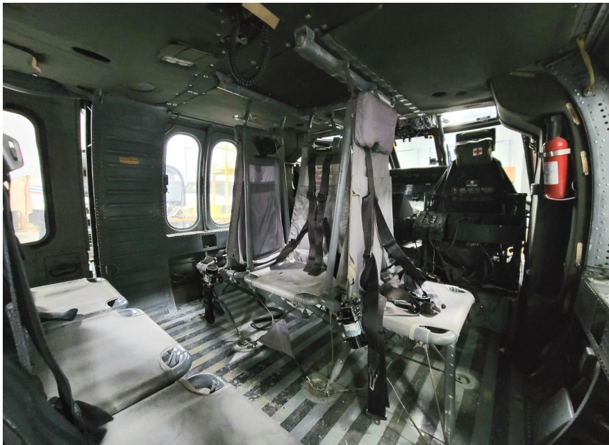
Crew cabin looking forward.