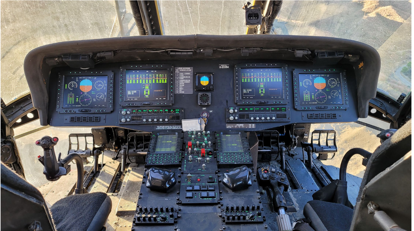
UH-60 Black Hawk with modern (M series Hawk) instrument panel