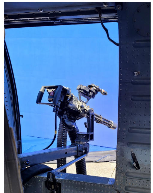
Mini Gun mounting is available.