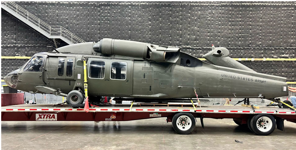
Shipping the UH60 is easy via a step-deck trailer using a main landing gear cradle.