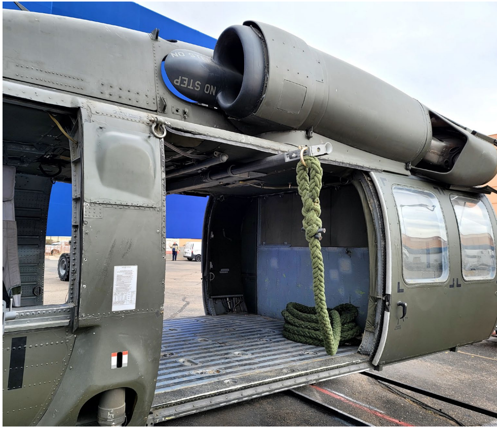
Black Hawk is set up for having a Fires Bar installed for Fast Rope drop.